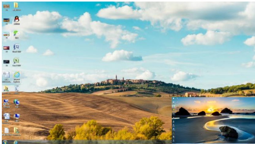
1 large 3 small (left and right )