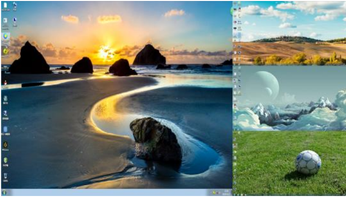
1 large 3 small (up large and down small )